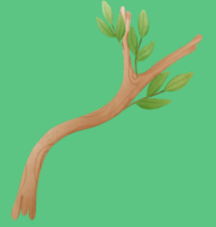
Small branches (max of 10cm x 30cm)