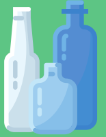
Glass bottles /jars (empty)