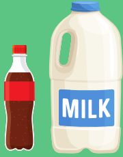
Plastic bottles /containers