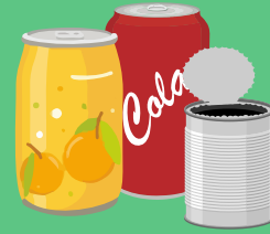
Aluminium /steel cans (empty)