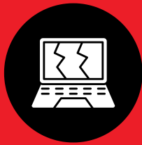
Electric waste (e-waste)